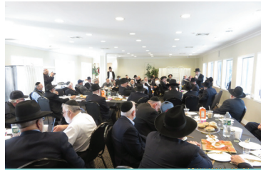
At the Agra D'Pirka Koheles siyum.